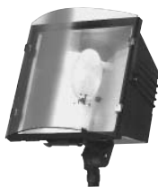
SLA Mini Flood with SL552 shield

All HPS lamps are E/B17 medium base. Metal halide lamps are ED17 medium base. Mercury Vapor lamp is E/B17 medium base. Normal power factor and high power factor ballasts available, see lamp source for specific ballast information. High pressure sodium capable of starting at -40° F and metal halide at -20° F.